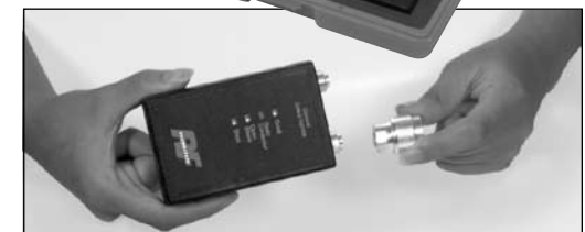
The RFA-4018-20 cable tester mates with all female Unidapt® adapters.