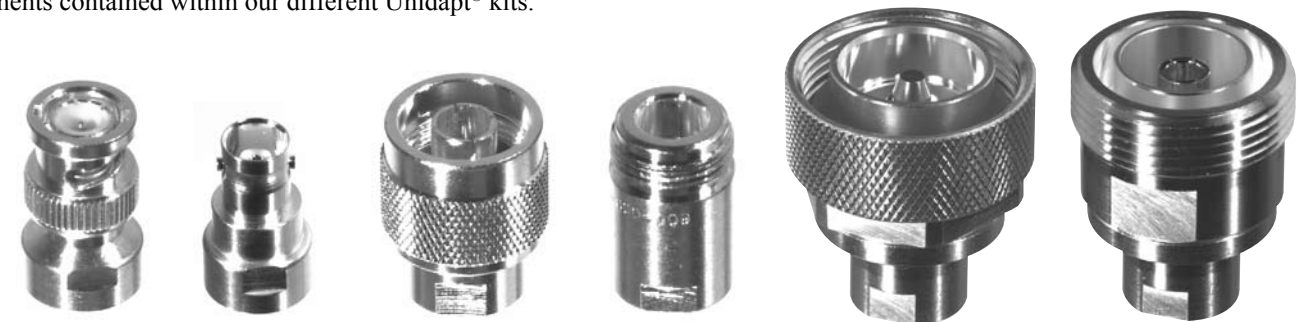
How the Unidapt® System works . . .

Our Unidapt® coaxial adapter series has been a favorite of field and bench technicians for years. Unidapt® has been our most popular RF Connector brand kit and adapter series. Unidapt® adapters are low loss, high performance connectors made of silver-plated, machined brass bodies with gold plated contacts and Teflon® insulation. The RF Connectors' brand Unidapt® adapter system answers the needs of technicians and engineers by providing the right adapter when needed. Any male to male, female to female, or male to female adapter is produced quickly and easily — perfect for remote antenna sites. Simply mix or match the pieces to create your required adapter. If a standard adapter is not immediately available, it can be made instantly using the wide selection of components contained within our different Unidapt® kits.