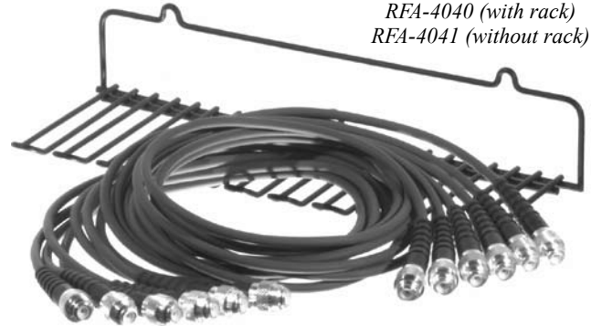
RFA-4040 (with rack) RFA-4041 (without rack)

Flange adapters are available for both Bird and Telewave wattmeters, converting them for use with the Unidapt® system of adapters.